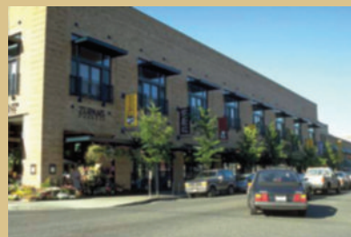
Diversity and mix of uses