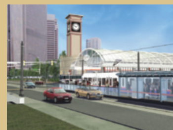
Transit centers with connectivity