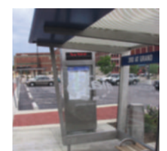
Kansas City MAX line shelter