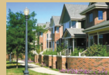
Compact and efficient land use