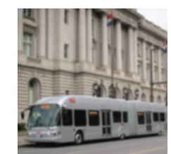
Cleveland, OH rapid transit vehicle

Real-time Passenger Information Reliable Transit Service