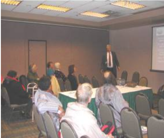
Davenport December 2005 Open House

Two open house meetings were held on Wednesday, December 14th and Thursday, December 15th, 2005 from 3:00 p.m. to 6:00 p.m., in the Cities of Davenport and Bettendorf, respectively. The Davenport open house was held in the RiverCenter located at 136 East Third Street. The Bettendorf open house was held in the Bettendorf Library located at 2950 Learning Campus Drive.