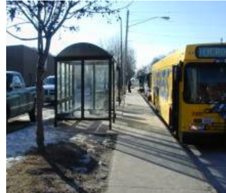
Transfer point at 16 th Street in Davenport

For both the January and December 2005 open house meetings, 1,500 news flyers were printed and distributed to the BSRC, and the cities of Davenport and Bettendorf. The BSRC mailed 233 flyers to individuals throughout the Quad Cities area. Groups who received the mailing included the Regional Transportation Advisory Group, Job Access Reverse Commute, the Study Advisory Committee, Quad Cities Air Quality Task Force, Disabled Transportation Advisory Group, and the Drug and Alcohol Testing Consortium. Project Flyers were made available at the Davenport Transit Center, City