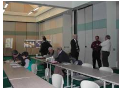
Bettendorf January 2005 Open House

The three-hour long meetings provided an introduction of the project to the public. URS staff introduced the purpose of conducting the study, including an overview of various alternatives to be considered using the Federal Transit Administration's process. These alternatives included bus rapid transit, light rail transit, commuter rail, trolley/streetcars, and personal rapid transit.