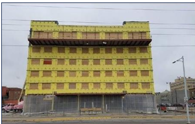
The Merrill Hotel, Muscatine, IA January 25, 2017

The Merrill Hotel and Conference Center, a MMRLF loan recipient, is a cornerstone project for Muscatine’s downtown and its redevelopment. The project includes an 114-room hotel, conference center and ballroom, two-story parking garage, and associated outdoor improvements.