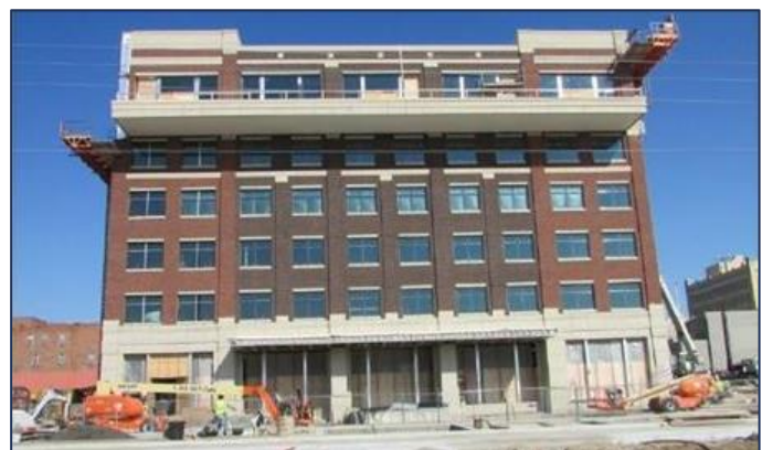
The Merrill Hotel, Muscatine, IA September 5, 2017