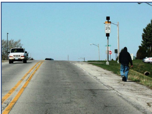
Cedar Street, Muscatine (Before)