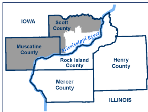
Region 9 Transportation Planning Area

Overall, federal funding under the FAST Act (Fixing America's Surface Transportation) is flat and reflects the challenges faced nationally to find revenue sources to replenish the Highway Trust Fund in order to improve the nation's and our Region's transportation network. The Commission approved resolutions to authorize application of the federal transportation planning grants with the States of Iowa and Illinois, assurance of match and execution of the respective grant agreements.