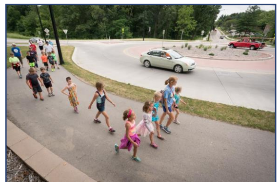
Cedar Street, Muscatine (After)