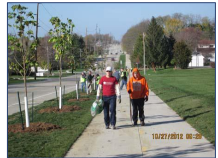
Tanglefoot Lane Separated Trail and Bike Lanes (2012)

In Muscatine, the city developed both Complete Streets and Sidewalk Policies as part of a Wellmark Grant and Blue Zones certified community designation. The city’s Complete Streets Policy was ranked 8 th best nationally in 2013 by Smart Growth America. The policy was put to use on a segment of Cedar Street that serves a school, YMCA, hospital, and retail and employment areas. The corridor went from virtually no non-motorized travel to 15,000 trips per year by walkers and bicyclists. Before and after photos show the striking difference for Cedar Street. The success has cemented the Complete Streets concept in the community and is being applied to their largest project along Mississippi Drive between the river and their downtown. Lessons learned to-date were to get community support, implement viable and visible project locations, and be flexible, adapting to the site conditions.