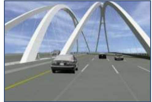
New I-74 Bridge rendering with expanded lanes and shoulders

The reconstructed I-74 Bridge will have three lanes in each direction with an additional auxiliary lane between the first ramp in downtown Bettendorf and the first ramp in downtown Moline. It will also have full shoulders allowing for a pull-off area for disabled vehicles and emergency vehicle access in the event of an incident. The reconstructed I-74 Bridge will have increased protection for seismic occurrences and barge collisions and is being built to last 100 years. Additionally, it will include a rare interstate multi-purpose trail along the downstream side with access to the Mississippi River Trail in Moline and Bettendorf and an elevator to access ground-level recreational facilities in Bettendorf.