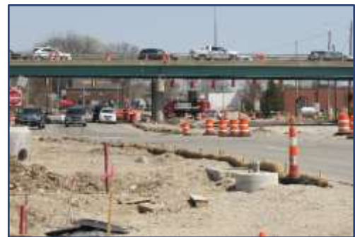
I-74 Bridge street prep work in Bettendorf